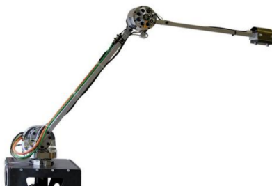
(a) ELLA robot (3 dof) from the Institute of Robotics at the JKU Linz.

In the present work, a comparison of different methods to model a 3D flexible robot for the computation of the feedforward and feedback actions is made. This comparison is carried out for the particular case of the ELLA robot, shown in Fig. 1(a). This lightweight and flexible robot, built by the Institute of Robotics at the JKU in Linz, has two flexible links and three actuated degrees of freedom (dof). The computation of a feedforward action is based on the inverse dynamics of the robot, solved using the optimization approach [4] extended to 3D systems. Currently, the controller only involves a feedback action which is evaluated based on a model of the ELLA robot which models the link flexibility using lumped mass elements such as springs and dampers elements. Accelerations and velocities of the links, measured through IMUs, are fed back to insure an efficient control of the robot. A second model is based on a finite element approach and models the distributed link flexibility and joint imperfections using beam elements and kinematic joints. A representation of the finite element model is seen in Fig. 1(b). For these two models, various questions related with the control design problem are addressed including the identification of the model parameters based on experimental measurements, the computation of the feedforward action using an offline optimization algorithm as well as the design of the feedback action and its real-time implementation in the controller.